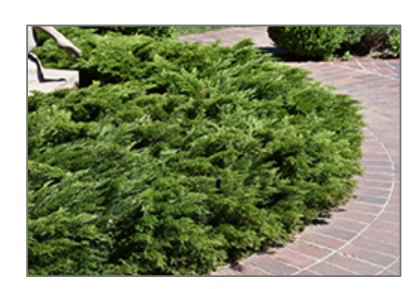
Calgary Carpet Juniper

A highly regarded groundcover evergreen for home landscape use; very attractive and soft light green foliage, low growing and wide spreading with gently arching branches; excellent in massing and groupings or as a groundcover