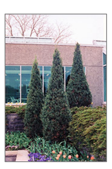
Skyrocket Juniper

An extremely narrow, rigid tall evergreen shrub, with soft blue-green needle-like foliage all season long; use with caution, can be rather abrupt in the landscape, makes a curious, almost formal tall evergreen hedge when planted in a row