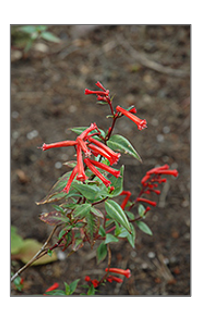
Cigar Flower flowers

Cigar Flower's pointy leaves remain dark green in colour throughout the year on a plant with an upright spreading habit of growth.