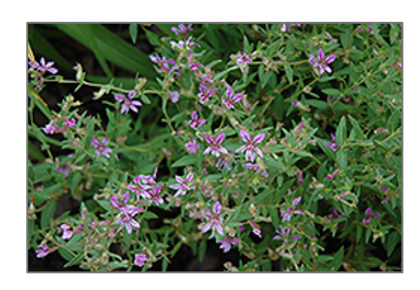
Sticky Waxweed flowers

Small, freely branching shrub or subshrub with unusual violet tubular flowers that open to a star shape displaying purple stripes; grown as an annual in cooler climates; rarely available, and largely eclipsed by showier hybrids