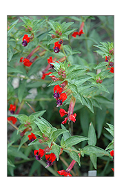
Bat Face Cuphea flowers

Bat Face Cuphea has panicles of violet tubular flowers with black overtones and curiously fluted crimson tips at the ends of the branches from mid spring to mid fall, which are interesting on close inspection. Its pointy leaves remain green in colour throughout the year.