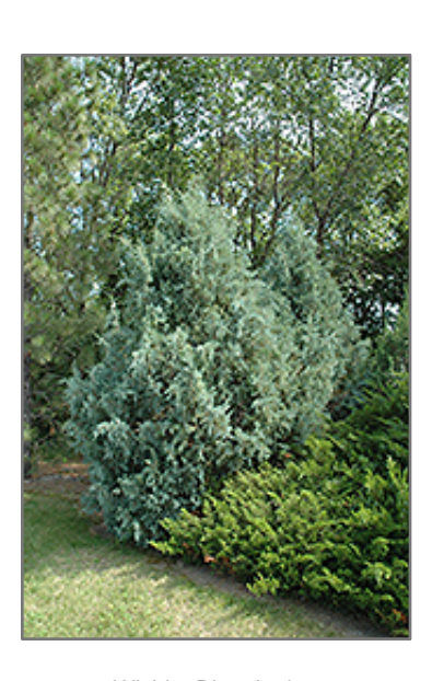
Wichita Blue Juniper