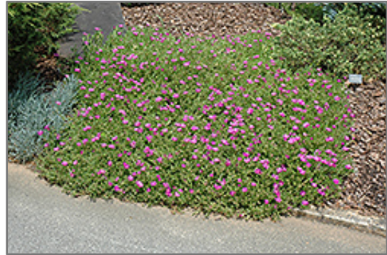
Purple Ice Plant in bloom

Purple Ice Plant will grow to be only 2 inches tall at maturity extending to 3 inches tall with the flowers, with a spread of 24 inches. Its foliage tends to remain low and dense right to the ground. It grows at a fast rate, and under ideal conditions can be expected to live for approximately 5 years. As an evergreen perennial, this plant will typically keep its form and foliage year-round.