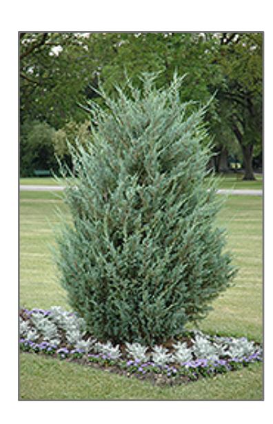
Moonglow Juniper