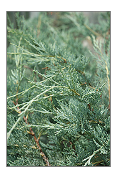
Moonglow Juniper foliage