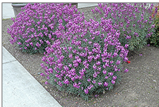
Bowles Mauve Wallflower in bloom