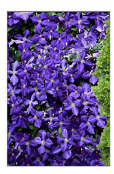
Jackmanii Clematis in bloom