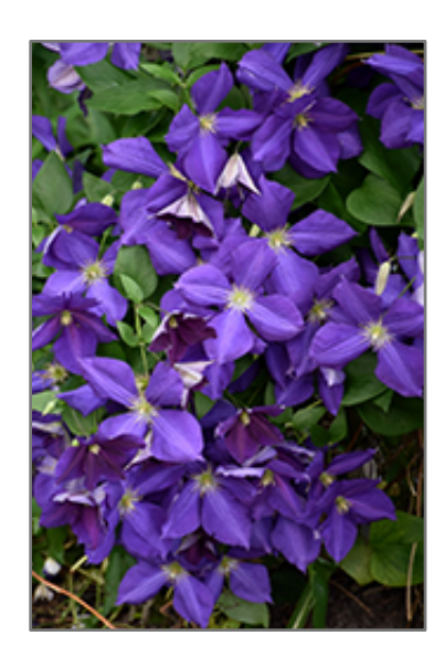
Jackmanii Clematis flowers