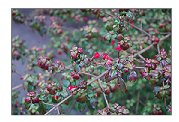
Small Leaf Fuchsia flowers

A fine fuchsia variety featuring dainty white nodding flowers that may show a pink flush; small bright green leaves give a finer texture; very attractive to hummingbirds; a dense self supporting round shrub