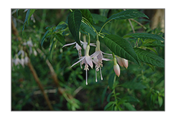
Mrs. W.P. Wood Fuchsia flowers

A pretty fuchsia variety featuring dainty pink and white nodding flowers that contrast the small green foliage; very attractive to hummingbirds; tends to be more cold hardy than the species; resistant to mites