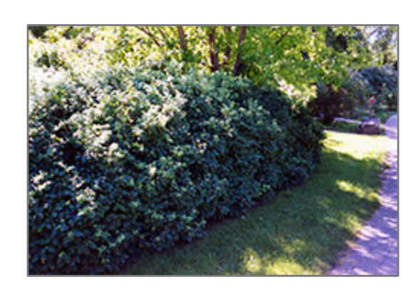
Clavey's Dwarf Honeysuckle

A medium sized ball-shaped shrub with dusty green foliage, small yellow flowers in spring and red berries in fall; excellent choice for use in groups or for hedges and screening because of its consistent shape; easy to grow and very adaptable