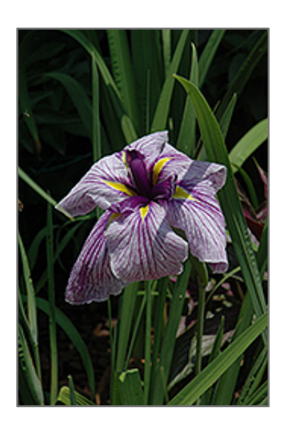
Japanese Water Iris flowers