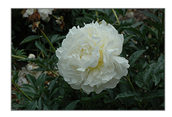
Marie Lemoine Peony flowers