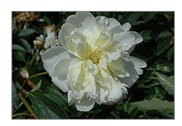
Primevere Peony flowers