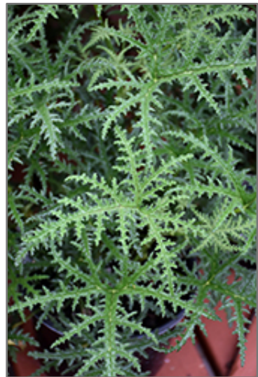
Pine Scented Geranium foliage