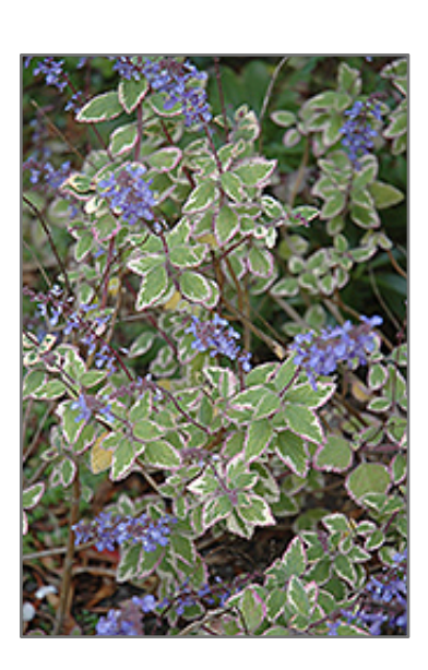
Blue Yonder Plectranthus flowers

Attractive spikes of sky blue flowers are impressive when massed above soft green foliage that is edged in white; mounded form should be occasionally trimmed to maintain shape; a lovely addition to the garden or containers; heat tolerant