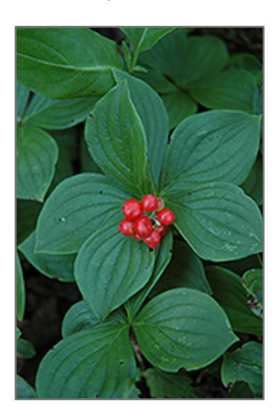
Bunchberry fruit