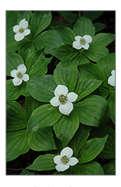
Bunchberry flowers