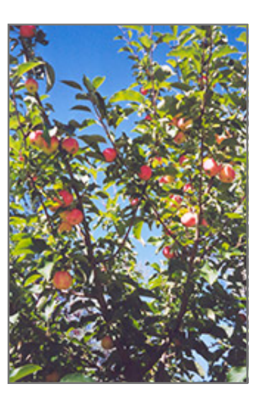
September Ruby Apple fruit