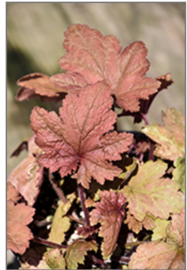
Autumn Leaves Coral Bells foliage

Beautiful emerging red foliage fades to taupe in summer, then brilliant ruby in the fall and winter; spikes of creamy white flowers in summer; amazing contrast to other plants; great versatility; keep soil moist in heat of summer