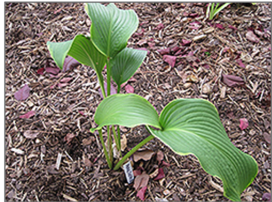
Abba Dabba Hosta

Other Names: Abba Dabba Do Hosta, Plantain Lily, Funkia