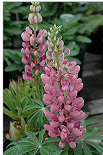
Gallery Pink Lupine flowers