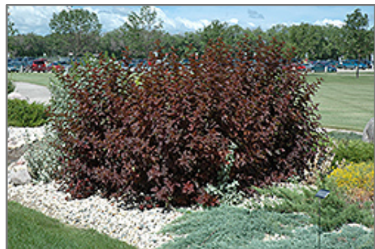
Diablo Ninebark