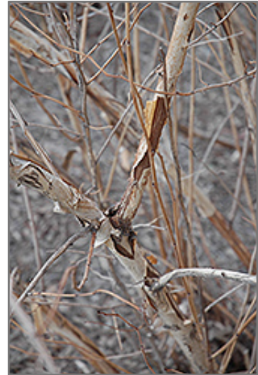
Diablo Ninebark bark

This shrub does best in full sun to partial shade. It is very adaptable to both dry and moist locations, and should do just fine under average home landscape conditions. It is not particular as to soil type or pH. It is highly tolerant of urban pollution and will even thrive in inner city environments. This is a selection of a native North American species.