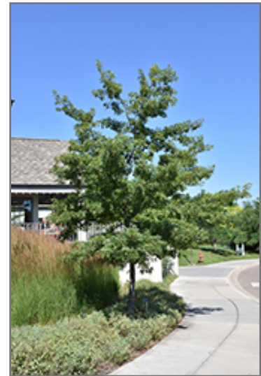
Majestic Skies Northern Pin Oak