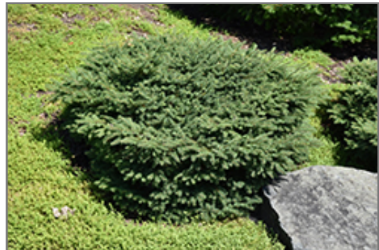
Birds Nest Spruce