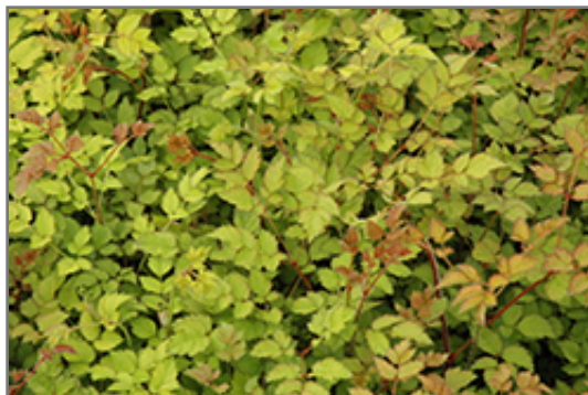
Color Flash Lime Astilbe foliage