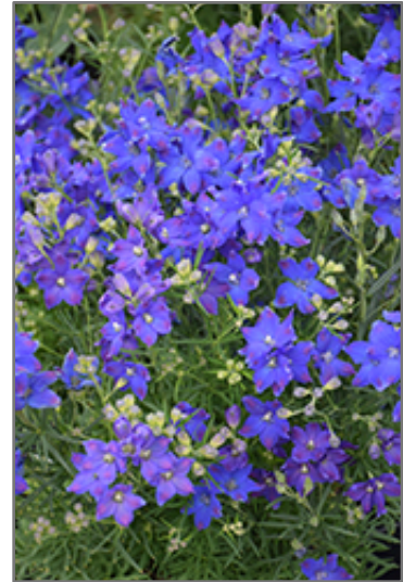
Diamonds Blue Delphinium flowers