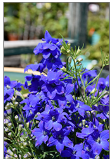
Diamonds Blue Delphinium flowers