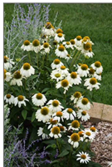
PowWow White Coneflower in bloom