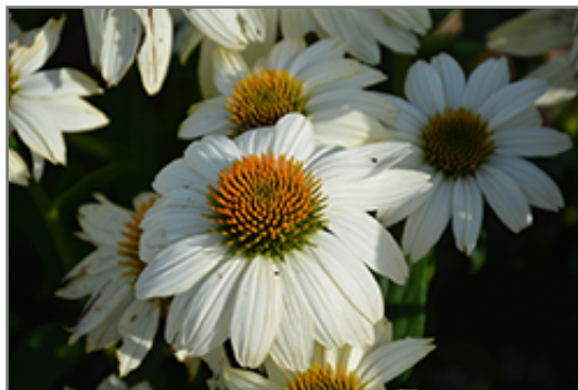
PowWow White Coneflower flowers

This is a relatively low maintenance plant, and is best cleaned up in early spring before it resumes active growth for the season. It is a good choice for attracting birds and butterflies to your yard, but is not particularly attractive to deer who tend to leave it alone in favor of tastier treats. It has no significant negative characteristics.