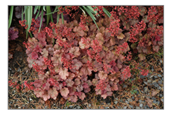
Cherry Cola Coral Bells in bloom

Cherry Cola Coral Bells is recommended for the following landscape applications;