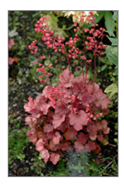
Cherry Cola Coral Bells