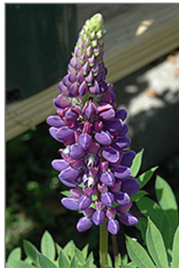
Gallery Blue Lupine flowers