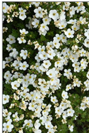
Abbotswood Potentilla flowers