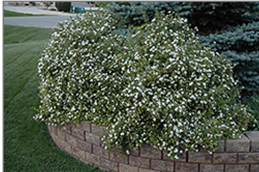
Abbotswood Potentilla in bloom