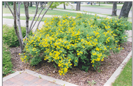
Coronation Triumph Potentilla in bloom