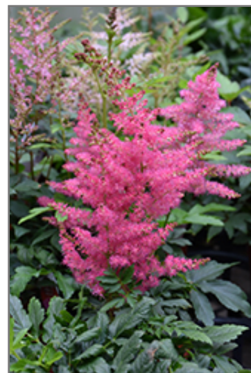
Younique Cerise Astilbe flowers

Feathery cerise-pink plumes, rise above dense foliage; best in a shady spot with dappled light; prefers moisture so water regularly for abundant flowers and nice foliage; perfect for mixed containers; plume heads can be left for winter interest