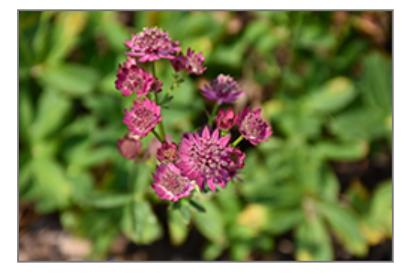
Venice Masterwort flowers