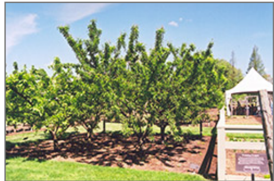
Mount Royal Plum

This tree is typically grown in a designated area of the yard because of its mature size and spread. It should only be grown in full sunlight. It does best in average to evenly moist conditions, but will not tolerate standing water. It is not particular as to soil type or pH. It is highly tolerant of urban pollution and will even thrive in inner city environments. This particular variety is an interspecific hybrid.