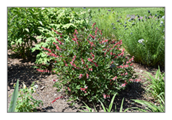
Valentine Bleeding Heart in bloom