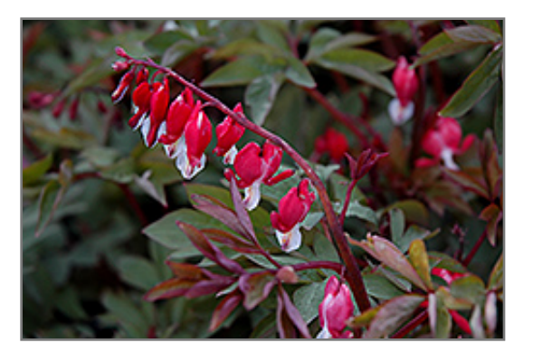
Valentine Bleeding Heart flowers