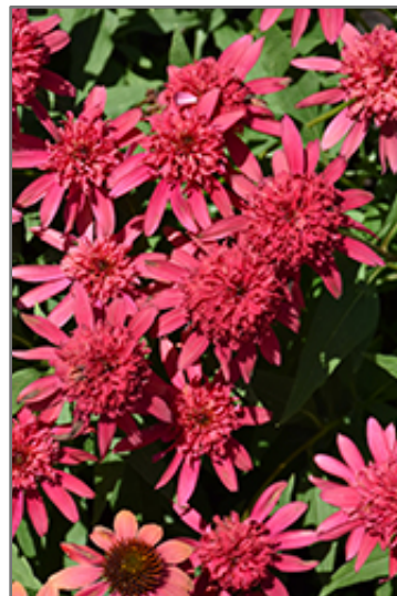
Double Scoop Raspberry Coneflower flowers

Double Scoop Raspberry Coneflower is recommended for the following landscape applications;