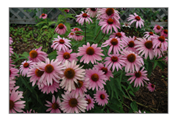
Magnus Superior Coneflower flowers