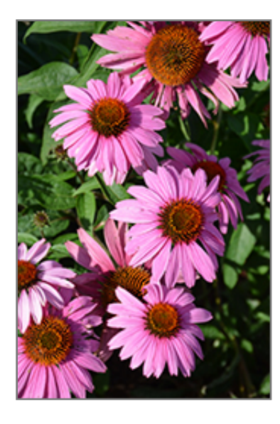
Magnus Superior Coneflower flowers

This is a relatively low maintenance plant, and is best cleaned up in early spring before it resumes active growth for the season. It is a good choice for attracting birds and butterflies to your yard, but is not particularly attractive to deer who tend to leave it alone in favor of tastier treats. It has no significant negative characteristics.