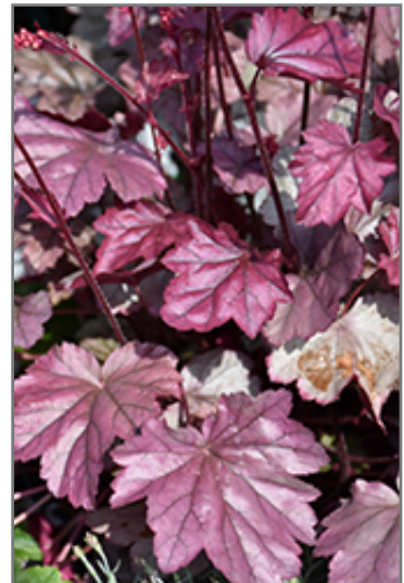
Stainless Steel Coral Bells foliage