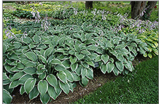
Winter Snow Hosta in bloom