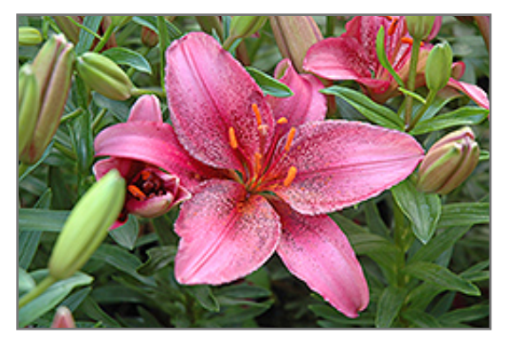
Lily Looks Tiny Spider Lily flowers