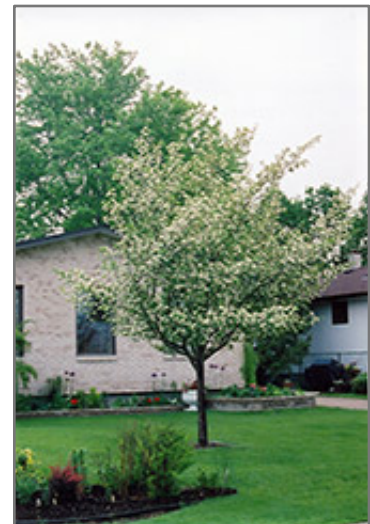
Snowbird Hawthorn in bloom