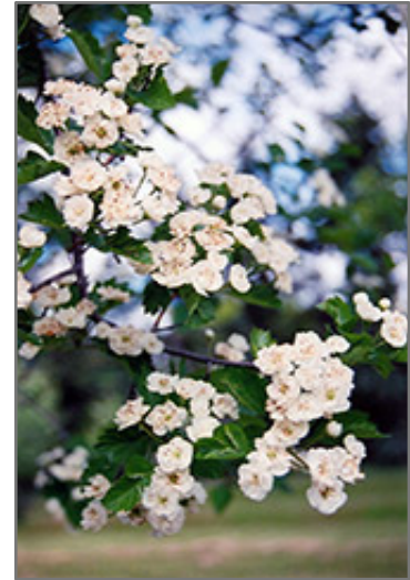
Snowbird Hawthorn flowers