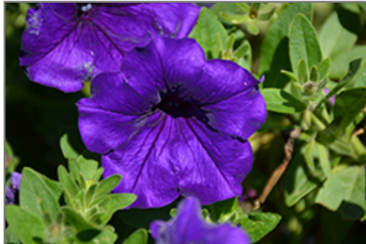
Easy Wave Blue Petunia flowers