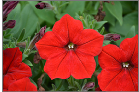
Easy Wave Red Petunia flowers

Easy Wave Red Petunia is a dense herbaceous annual with a trailing habit of growth, eventually spilling over the edges of hanging baskets and containers. Its medium texture blends into the garden, but can always be balanced by a couple of finer or coarser plants for an effective composition.