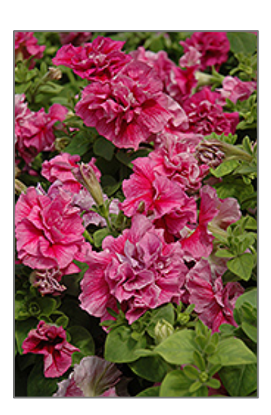
Double Madness Sheer Petunia flowers

Double Madness Sheer Petunia is blanketed in stunning double shell pink frilly flowers with hot pink overtones at the ends of the stems from mid spring to late summer. Its pointy leaves remain green in colour throughout the season.