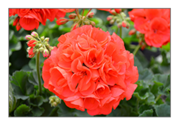
Allure Hot Coral Geranium flowers

Hardiness Zone: (annual) Group/Class: Allure Series