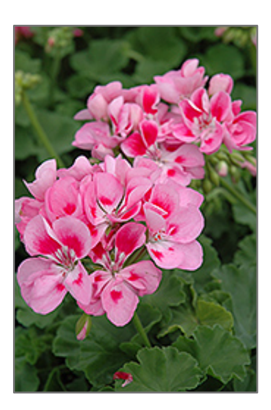
Allure Light Pink Geranium flowers

Allure Light Pink Geranium features bold balls of lightly-scented semi-double shell pink flowers with white eyes and cherry red streaks at the ends of the stems from late spring to early fall. The flowers are excellent for cutting. Its tomentose round palmate leaves remain green in colour with prominent brown stripes throughout the year.