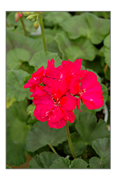
Allure Purple Rose Geranium flowers