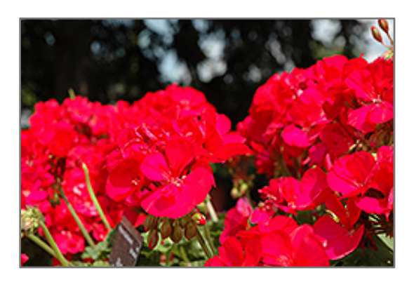
Allure Purple Rose Geranium flowers