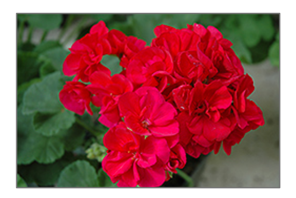
Americana Cranberry Red Geranium flowers